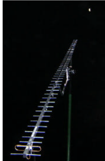
EA9/DL3OCH 59 el, 19.7dB yagis pointed at the moon!

the diode is feed to the midpoint of the switch and from this point directly to the instrument. This is what happens normally and corresponds to x1 position. From the two other positions, a PCB multiturn pot is connected to the point where the instrument is fed. As I recall a 5 or 10 k pot is required. To calibrate, start with the switch in the center position (x1). Using a 1 kW slug, apply 1 kw to the power meter, then switch to the x2.5 position and adjust for the 1 kW point on a 2.5 kW scale. Secondly, switch to the x2 position and adjust for the 1 kW point on a 2 kW scale. If you have a 500 W slug, you can follow the same procedure with 500 W applied to obtain 1250 W and 1 kW scales. This modification has been used at OZ1EME with a Bird meter for many years. It is now also in use with a DIALECTRIC version I have. Theory is that you are applying a maximum of 2.5 volts on the diode, and it can easily handle this "over voltage".