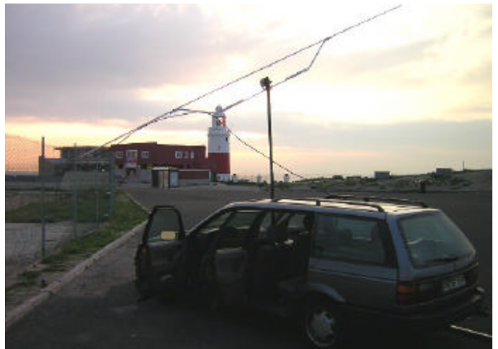
ZB2/DL3OCH's 1296 EME operating position in Gibraltar