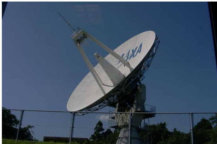
18 m (Gregorian feed antenna) JAXA dish