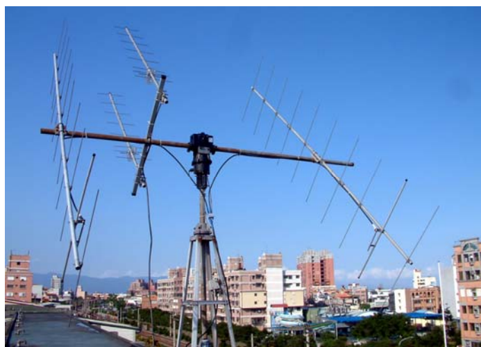
BX1AD 2 yagi array used on 70 cm EME