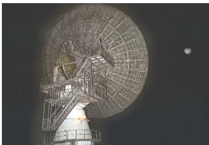
8J1AXA "BIG DISH" looking towards the Moon

on our sun noise measurements. (The Sun might be too large in size to give the exact beamwidth of this antenna). We stopped operation at an elevation of 5 degs due to the ITU regulation. After moonset we made ground-wave QSOs (using low power) with some 60 stations within approx. 600 km range. Next operation is not yet set, and maybe around the year end or early New Years day. We also plan to have invites from school children in the future. The team included JH1AOY, JA1DYB, JE1CKA, JE1BNZ, JE1OYE, JE1KOE, JH1KRC, JM1GSH, JF6DEA, JA9COB, JA0GPT, JA0TJU, JR0XHL, 7N1KAE and ON4MU/JF1EIO/AI4XZ (visiting from Tokyo).