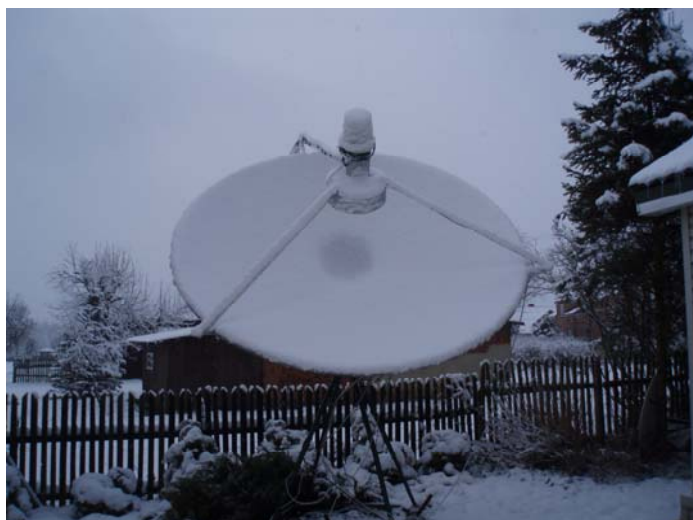
SP7DCS's 3 m dish use in the SSB Contest

SP6JLW: Andy sp6jlw@wp.pl reports that he and Jerzy, SP6OPN operated the 1296 EME SSB Contest together and achieved a score of (22x2 + 3)x11 = 517 points. They used a 6.5 m dish and 16 x BLV958 1 kW SSPA and ATF54143 LNA. QSO'd were on 7 Feb at 1432 OK1CA (53/56) JO, 1555 P19CAM (54/58) JO, 1607 LX1DB (57/56) JN, 1631 UT5JCW (55/57) KN, 1634 ON7UN (57/57) JO, 1643 JA4BLC (52/55) PM, 1650 LA9NEA (55/55) JO, 1711 OE9ERC (58/55) JN, 1740 IW2FZR (42/54) JN, 1742 DF3RU (55/56) JN, 1813 OZ4MM (58/57) JO, 1840 SV3AAF (56/55) KM, 1854 G4CCH (56/57) IO, 1914 HB9Q (58/57) JN, 1936 RW3BP (53/54) KO, 1948 GW3XYW (53/44) IO, 2046 OH2DG (53/44) KP, 2319 HB9MOON (55/55) JN and 2330 ON4BCB (54/53) JO, and on 8 Feb at 0018 K2UYH (55/57) FN, 0241 OK3RM (44/54) JN, 0245 VE6TA (55/55) DO, 0253 OZ6OL (44/54) JO, 0325 VA7MM (55/55) CN and 0401 NY2Z (55/55) FN.