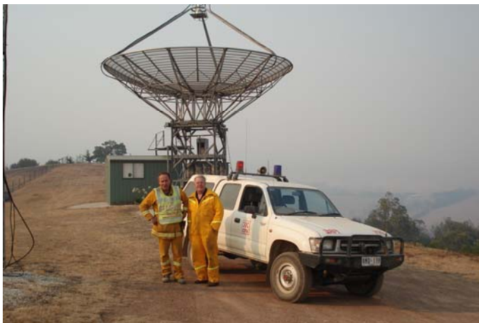
VK3UM (r) and friend fighting the fires