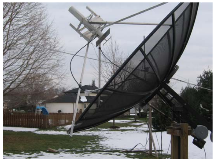
WA8RJF's dish used to make first 902 EME QSO with W5LUA in nearly 10 years. A dual dipole feed was used.

I plan to be active for the EWW/DUBUS 10 GHz (WX permitting) and the 432 EME Contests and will be looking for you all. PSE keep the reports, info and tech material coming. 73, Al - K2UYH