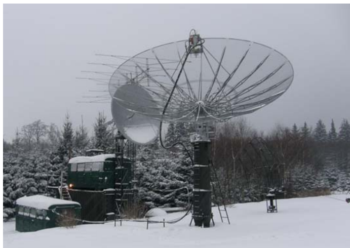
SP6JLW 2010 SSB Funtest top funmaker!

DK3WG: Jurgen dk3wg@online.de was very glad to worked UN7GK for 432 DXCC #87 in Feb. He also added initials with FY/DL2NUD and OK1YK to bring him to mixed #494*.