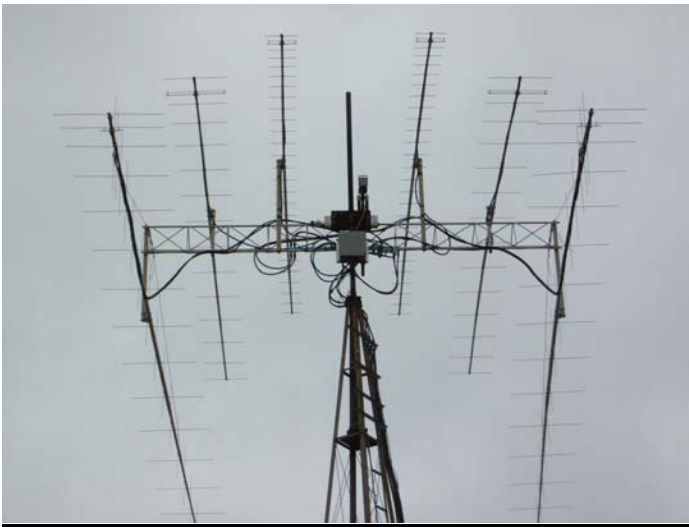
WD4JHD's 2 yagi array (incenter) used on 70 cm EME.

WD5AGO: Tommy wd5ago@hotmail.com I am setting up for the 9 cm DUBUS Contest in March and switch back for the 13 cm contest in April from my home QTH. I will also be operational on 16/17 April on 70 cm from another location. We will only be on near moon rise on 17 April but will be on the whole pass on 16 April and 1400 through 0200 the 17th. I am interested in skeds for my western window up to almost moonset on 70 cm.