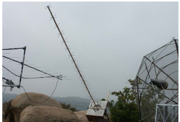
WA6PY's Feed Yagi