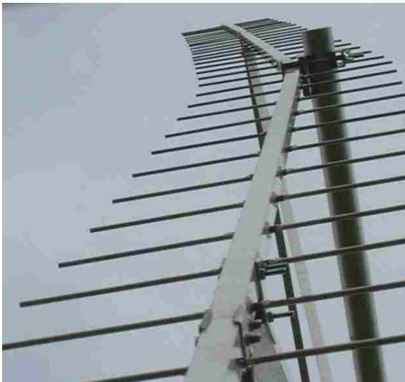
Bernd's bent yagis

DL7APV: Bernd d17apv@gmx.de had another wind disaster – I was hit by another Tornado. Unlike 2008 when my vertical array was destroyed, this time all antennas are still there, but most of the yagis are bent. My Sun noise is down by about 2 dB. I will try to fix the array, but expect some difficulty in bending the aluminum back in place while standing on a 5m ladder. I may have to disassemble the array and repair each antenna on the ground. The wind speed was up to 150 km/h and as 2 years ago, many trees were blown over. The chicken egg sized hailstones crashed into the roof of my neighbor's indoor riding school. About 100 km south, we had a F3 Tornado same day. It seems we are now getting mid west US WX here. In the digital ARI contest on 70 cm activity was very low, but I was happy to work 3B8EME, OH6UW (75 W and a 19 el yagi), LZ1OA (4 yagis and 500 W), K8SIX (1 yagi and 500 W) and PY2OC (1 yagi and 100 W). Back on 16 May, I worked R2/DL1YMK with a super signal. It was the loudest ever heard from them. Their new feed seems to be working very well. I am still planning to add a vertical array for 432. The mounting is almost complete. [Bernd is now QRV again].