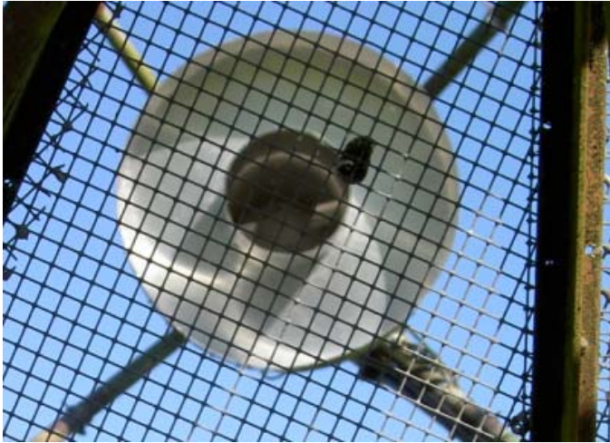
G3LTF's 6 cm feed

Don't get the 6 cm AW mentioned at the start of the NL.