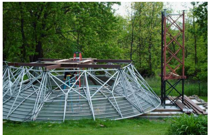
Progress on mounting WB2BYP's 28' dish

ZS5Y: Derek derek@fotogravett.com is now QRV on both 70 and 23 cm EME. On 1296 he is using a 3.5 m dish with a septum feed working and running about 150 W in the shack. Thus far I have worked on JT the following stations on 23 cm: PI9CAM (8DB), G4CCH (15DB), OK1DFC (13DB), OK3RM (20DB), PA0BAT (21DB), PA3DZL (19DB), PY2BS (14DB), RD3DA (14DB), UA3PTW (21DB), VK2ABP (23DB), VK2JDS (18DB) and VK4CDI (25DB). I will soon move my SSPA to the feed and will then try some CW.