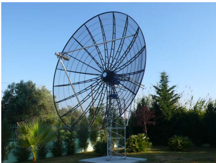
SV1BTR's new 6.1 m dish for 70 & 13 cm

S51WX: Dusan is a new station on 432 EME in JN75OS. He has 2 x 18 el Wimo 5 WL yagis in horz pol and 250 W to an SP-7000 in shack with 12 m of low loss Celflex cable. Thus far he has worked UA3PTW, KP4AO, P19CAM, DL7APV and OK1DFC. He has also heard DK3WG and I1NDP.