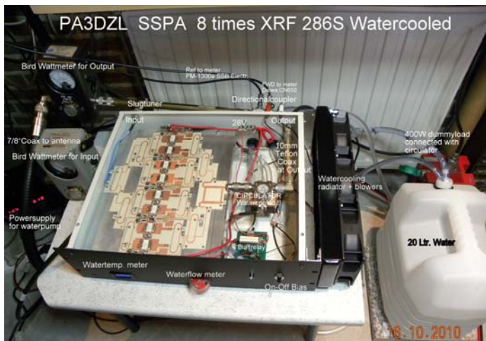
PA3DZL's water cooled 23 cm SSPA