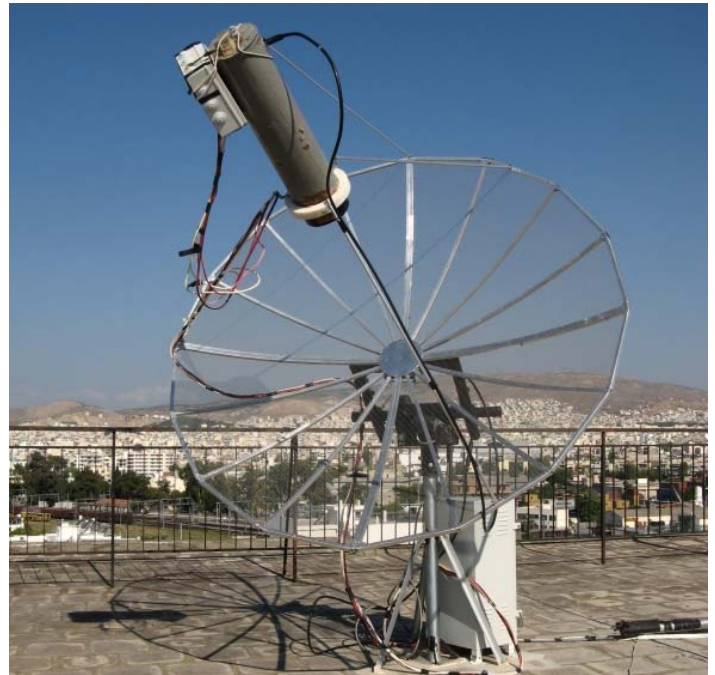
SVICAL's 2 m dish with septum feed and 45 W SSPA