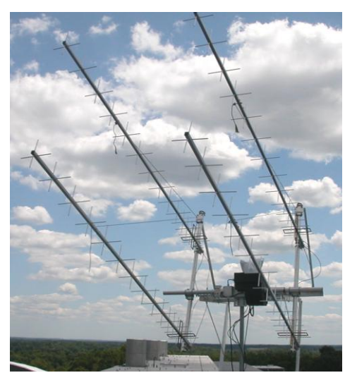
W2PU's 4 x 15 el cross yagis on 432

W2PU: Joe k1jt@ARRL.NET reports that the club station at Princeton University is now QRV on 432 -- We're continuing to make good progress on the 70 cm EME setup at W2PU. Our antenna is now an array of 4 rear-mounted, 15-el dual-polarization yagis. With the present solar flux (S-410 = 45 SFU on 7 Aug), we see nearly 10 dB of Sun noise. The TX power is about 600 W. In the first few hours of being QRV, we put JT65B EME QSOs with LU8ENU, K3MF, and KD5CHG in the log. The latter two were done at an especially poor time of the month, with degradation around 5 dB. We hope add many more initials during the coming DUBUS 432 Digital EME Championship event! [Since this report W2PU has added several additional QSOs].