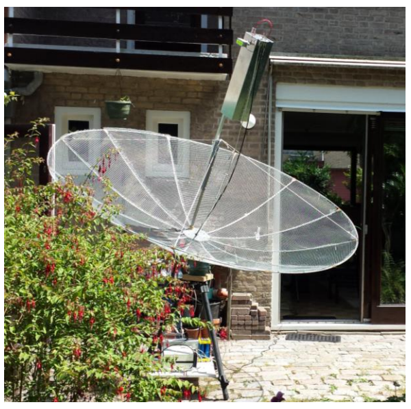
PA0HRK's portable 2.4 m dish

PAOHRK: Harke harke.smits@hccnet.nl is hearing on 23 cm and hopes to be on TX soon -- I recently received my first EME signals. I have constructed a stress type 2.4 m prime focus dish that can be dismantled in triangular sections. The support structure is made of 8 mm fiberglass rods, used in the kite industry. It is like a classic wheel with 12 spokes, 1.2 m each. A rim forces the spokes into a parabolic shape. Spokes and rim are connected by means of hard soldered T shaped brass tubing. The reflector is made of triangular pieces of 10 mm mesh. I need only four ropes to make the structure rigid enough for use as a dish. The system can be set up in about one hour. Normally it's in the garage. The 23 cm feed is OK1DFC circular horn; the LNA is a WA2ODO design (NF 0.25 dB). I also made a RA3AQ feed for 13 cm, but I am focusing first on 23 cm. I only have 6 dB of Sun noise, but that's probably because I cannot find a good cold direction in my small back yard. I have only a slot of two usable hours. I have heard SM4IVE and I1NDP, both on CW. I now need to work on the TX. I already have a 150 W PA. I will be attending the EME conference in Brittany (also for the first time) and am looking forward to meet other more experienced EMEers there.