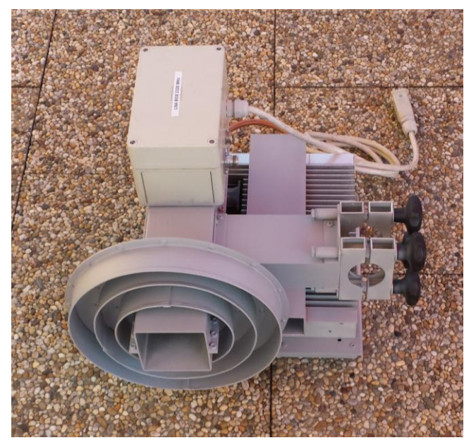
OK1DFC's 13 cm feed with 250 W SSPA and LNA

SP/OK5EME: Zdenek (OK1DFC) writes that he will be active during the Microwave and EME meeting in Poland. The meeting, which is organized by the SP EME group in Zieleniec is on 14 to 17 Aug – see <a href="http://splashurl.com/m4pse58">http://splashurl.com/m4pse58</a>. I will be there with my 3.2 m portable dish and 250 W at the feed and TRV for all 13 cm possible band segments. I will have also available a 10 GHz unit with 35 W at the feed and will try some contacts on 10 GHz too. This is the same setup I am expecting to use during my expedition to ZA in future. The 10 GHz equipment will be tested for the first time to give me some experience with how the system, especially my mesh dish with a 0.2° BW, will work. My plan is on Friday 15 Aug to build and test station on 13 and 3 cm, on Saturday 16 Aug to operate 13 cm for my full Moon window, and on Sunday 17 Aug do 10 GHz tests, then wrap up and drive home in the evening.