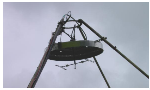
G3LTF's improve 432 feed with baffel

JA4BLC: Yoshiro's ja4blc@web-sanin.co.jp EME report -- I worked on 3 cm on 12 July JA8ERE (O/O), JA6CZD (559/569) and JA1WQF (559/559), and on 23 cm on 20 July JA1WQF (559/559), JA6AHB (559/O) and JA8ERE (559/549), and on 26 July JA6XED (559/449). There is very good news on 13 cm. In late July the Japanese Radio Authority sent out a request for public comment on spectrum usage for 2400 – 2405 MHz by Japanese moonbouncers. If they receive positive comments, they will permit operation on a new band after 5 Jan. 13 cm moonbouncers need to prepare receiving gear for 2400. I am not sure if we will lose 2424 after Jan 2015. My hope is that both bands remain usable.