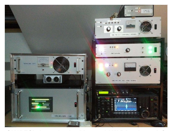
OK1DFC's ham shack with new 1 kW PA at lower left

OK1IL: Ivan ivaknn@gmail.com report on CW and JT65 on 23 cm -- I moved from the 2 m band where almost all traffic is JT65 to 23 cm with its mix of CW and JT65. I am try to adapt to having both here. CW is seemingly obvious, but I have limited experience with only about 10 CW contacts. When I should use TMO or RST reports? [It really does not matter. Both are mixed and accepted by all]. I have difficulty copying CW below -15 dB, but I can produce quiet a big signal with my 3 m dish and 800 W PA. After copying both callsigns I confirmed with (OOO), but QSO partner replied often with RST. [No problem as long as you can copy the RST. If you can't, continue sending O's with no R's until they hopefully will understand]. I find the common reflector for both CW and JT65 on HB9Q works well. After finishing a JT65 QSO, I can easily follow up on CW. Unfortunately I could not participate in the DUBUS 23 cm contest because my transverter failed just before its start – [Murphy]!