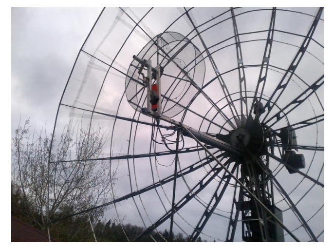
DL6SH's 8 m dish with 2 m rotatable ring feed in place

DL6SH: Slawek dl6sh@online.de sends his activity report for the 1296 Dubus contest in April -- I have spent most of my weekend on the Moon, and found good activity with very strong signals especially from Europe (EU). I may have missed some smaller stations and some of the activity from overseas, but worked 71x58 on CW or SSB. I contacted on Saturday: OK2DL, ES5PC, UA3PTW, HB9Q, OK1CS, OK1DFC, JA4BLC, OK1KIR, SP7DCS, G3LTF, OF2DG (OP OH2DG), OK1YK, HB9CW, JA8IAD, LZ1DX, DL3EBJ, OZ4MM, DJ8FR, 9A5AA, OK1CA, F5KUG, I1NDP, SP6ITF, JA6AHB, S53MM, G4RGK, HB9BCD, SP6JLW, F1PYR for an initial (#), I5YDI, PA3FXB, SP3XBO, RA3EC, G4CCH, DK3WG, OK2ULQ, SM4IVE, F6ETI (#), SM2CEW, S59DCD, SP2HMR, NC1I, N8CQ, PA3DZL, WA6PY, DF3RU, N5BF, VE4SA (#), IK5VLS, VE6TA, VE6BGT, KL6M, IK3COJ and ES6FX, and on Sunday: VK4CDI, PI9CAM, IW2FZR, OE5JFL, OH2AXH, LZ2US, YO2BCT, JH1KRC, ON5RR, LX1DB, PA2DW, N4PZ, K2UYH, F5HRY (#), OK1CS (DUP on SSB), IZ1AEM, VA7MM and VE4MA. My RX relay was good over nearly the whole contest, but at the end started acting up and I had to change it. My Swedish SSPA is working really well, and produced nice echoes. I was running my 8 m dish with a septum feed and my new 500 W SSPA at the feed. For rain protection, I use a cheap bucket. I can change my feeds with a tube in tube system. I am QRV on 144, 432 and 1296. (I have added a rotatable ringfeed for 2 m operation).