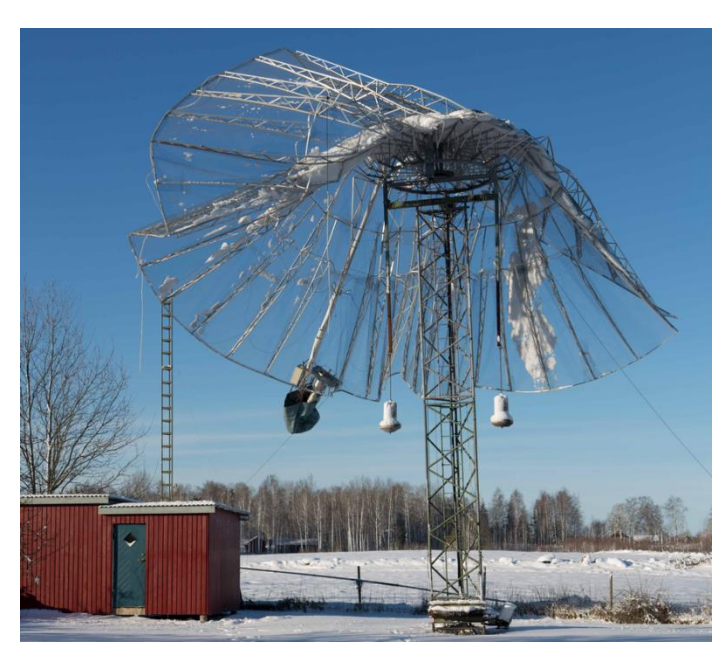
SM4IVE's broken 13.3 m dish - See Netnews

contest with my QRP (2.5 m dish) EME station. I QSO'd on 6 Feb at 1345 I1NDP (54/439) JN CW/SSB, 1457 PI9CAM (52/42) JO SSB, 1750 OK2DL (52/559) JN CW/SSB and 2002 K2UYH (42/559) FN for a score of (2+3)x3x100 = 1,500 points. Not great but great fun.