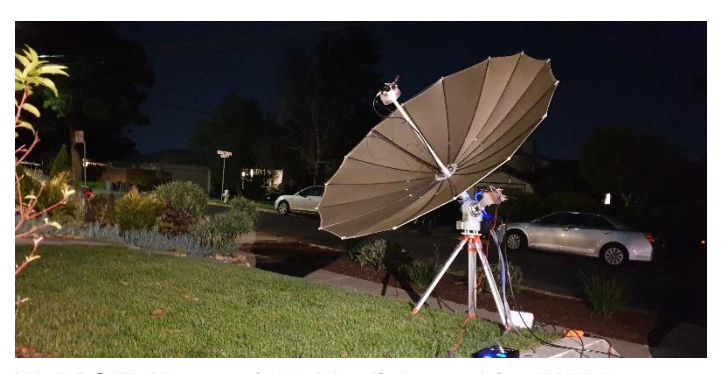
W6BB/NT6V 2.4 m foldable dish used for EME Demos

W6YX: Jim (N9JIM) n9jim-6@pacbell.net reports on the Stafford Club's results in the 1296 SSB Funtest -- KA6Q and I operated in the Funtest. We worked on 6 Feb all on SSB unless noted at 1843 I1NDP (55/57) JN,1849 PI9CAM (55/57) JO, 1857 OK2DL (57/57) JN, 1903 K2UYH (55/57) FN, 1922 SM7FWZ (579/559) JO CW/CW NC, 1933 RA3EME (56/44) KO, 1945 WA6PY (569/559) DM CW/CW NC, 1950 F5FEN (569/559) JN CW/CW NC, 2001 WA6PY (52/44) DM, 2058 VE6TA (55/55) DO, 2147 WA9FWD (42/55) EN, 2155 IK2DDR (55/44) JN and 2333 XE1XA (569/559) EK CW/CW NC for a score of 10x2x7x100 = 14,000 points. It was lots of fun to work stations on SSB off the Moon!