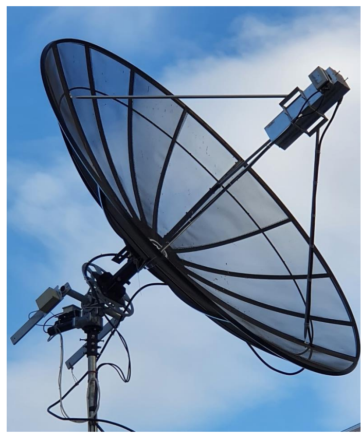
3 m dish used by HS0ZOP on 1296 in Thailand