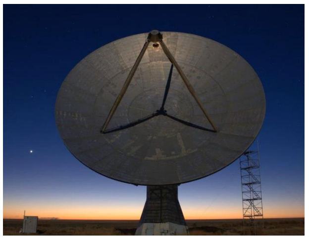
K0RPT/DSES 60' (18,3m) dish at sunrise