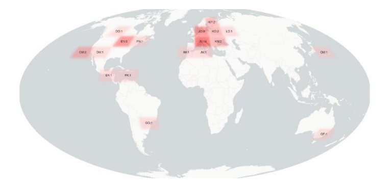
Map of activity in the EME SSB Funtest