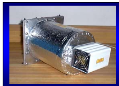
Rear View with TE Device