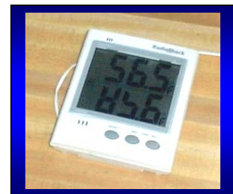
External Temperature vs. Cold Plate Temperature