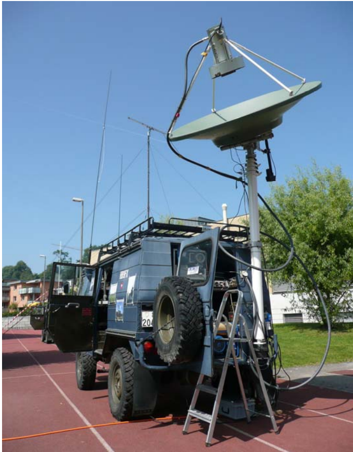
HB9D mobile EME demo in Richterswil, Switzerland