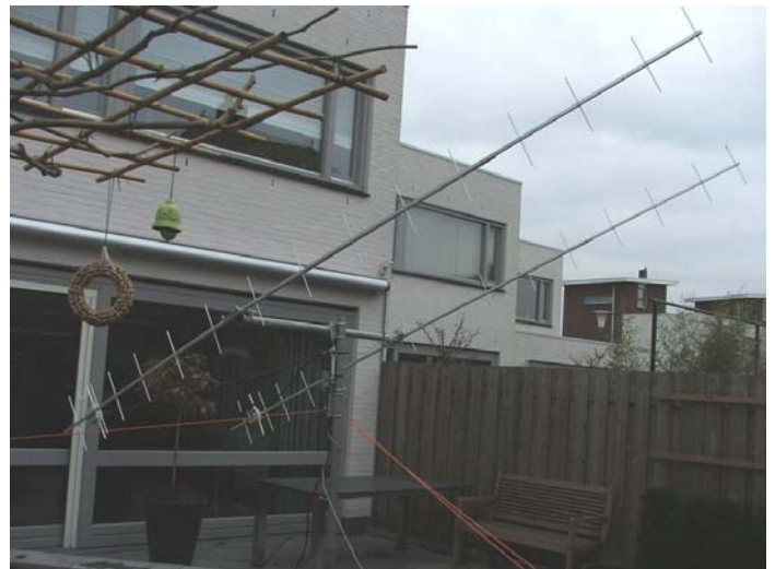
PE1RDP's 2 yagi 432 EME array

PE1RDP: Arno arno.bollen@chello.nl completed his third 70 cm EME QSO on JT65B with K2UYH in Aug -- I presently have 2 yagis and 50 W, but recently purchased a surplus TV SSPA capable of 1.5 kW on 70 cm, which I hope to have QRV very soon. My main problem is a lot of local noise. When I turn my antenna only a few degrees, the noise can decrease (or increase) 5 dB or more as seen on the SpecJT "meter". There seems to be nothing I can do about it. I also plan to improve my RX with a better preamp and switch to open wire with more yagis.