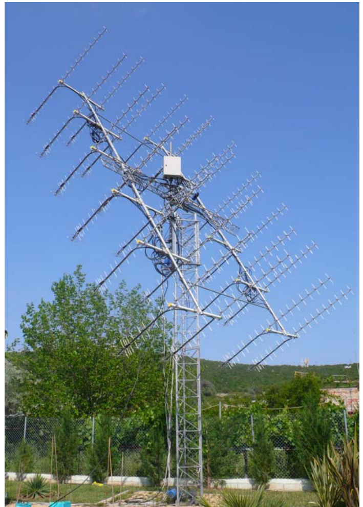
SV1BTR's new 70 cm 24 yagi EME array

they were quite helpful with information useful for their repair. I have the EL readout now working and hope to have the AZ working before the Microwave EME Contest (that I will be operating in conjunction with K1JT and using his call). Because of computer problem resulting from the lightning, I neglected to report 70 cm QSOs with on 20 July at 0350 LZ1DX (19DB/O) on JT65B and (O/O) CW for initial #704 on CW and #748* mixed mode, 0520 ZS6OB (25DB/O) on JT65B and 0525 CWNZ ZS6WAB (15DB/-) on JT65B. On 23 Aug also on 432 I added at 0630 PE1RDP (24DB/24DB) on JT65B #750*. I found activity on 23 Aug during the 70 cm CW ATP good despite the early hour and worked at 0610 W8TXT (559/579), 0620 FR5DN (569/559), 0645 G3LTF (559/559), 0658 K1RQG (579/579), 0707 OZ4MM (579/569), 0722 SV3AAF (449/549), 0742 SM2CEW (569/569), 0758 DJ7GK (O/O) #705 and 751* and 0812 KL6M (559/559). I was on 1296 on 30 Aug looking for HB9D (O/-) and heard him once but no reply because of the close sun, but did QSO G3LTF (559/559). During the Sept AW I will be on 13 cm and possibly 3 cm using the call K1JT. In between I will be looking for skeds on 70 and 23 cm.