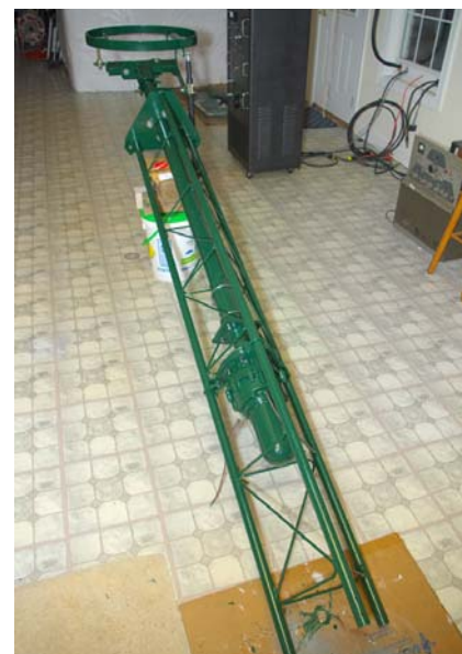
N2UO's mount for his new 20' dish