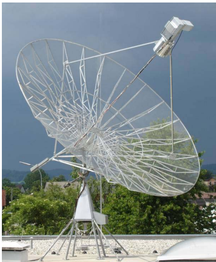
OE5JFL's beacon station – see story near enf of this NL

CONDITIONS: I cannot say that Aug was a particularly outstanding month EME wise. There was surprisingly good activity during the 70 cm CW Activity Time Period (ATP) on 22/23 Aug although Faraday was a problem for some fixed polarization stations. The portable EME test by HB9D – see their report, even with short notice caused a rise in 1296 activity, but was of limited success because of a near synchronized moon and sun. New DXCC stations to look for are KG6DX on 70 cm – see HB9Q's report and LZ1DX, who is just about ready for tests on 23 cm. This month's activity will be dominated by the ARRL's Microwave EME Contest on 20/21 Sept (13 cm and up bands). It is also the ARI's EME CW/SSB Contest weekend – not very good planning. There is no Sept 70 cm ATP because of the contests. The weekend is the official Sept activity weekend (AW), which does make sense because of its high declination and low loss.