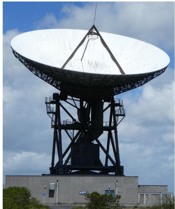
GB6GHY 32 m dish to be used on 3 and 6 cm in Aug

F6KRK: Bruno (F1MPQ) f1mpq@orange.fr writes that he and F4BUC are QRV on 23 cm with a 2 m dish and 250 W. [Suggest you email for skeds].