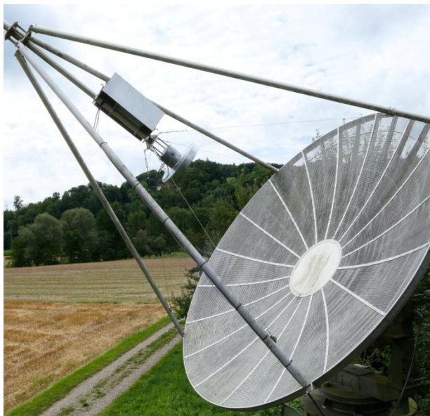
HB9MFG's 5 m dish at Bleien Radio Observatory