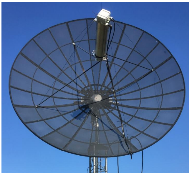
OK8WW's new 12' dish for 23 and 13 cm

OK8WW: Richard ok8ww@hotmail.com is a new 23 cm EME station operating from (JN79dv) – On Friday 21 July, I finished my 23 cm EME station and made my first QSO with OK2DL (559/559) on CW followed by RA3AUB, SP6ITF, PI9COM, OZ4MM, G4CCH and IK3COJ all on CW. I plan to also operate JT65 later. I am running a 12' mesh dish with 600 W SSPA to an OM6AA septum feed, G4DDK 0.3 dB NF LNA, SDR Afedri/IC-736 plus DB6NT MKU13G3-28 PRO.