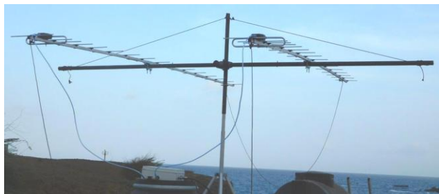
D44TVG's 432 2 yagis & RX box (DL1RPL below)