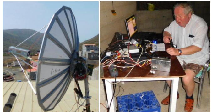
D44TVD 1.5 m dish with 13 cm feed / DL2NDD at op position

2240 HB9Q (15DB), 2256 PA3DZL (18DB), 2304 PA0BAT (21DB), 2314 OF2DG (20DB) and 2324 OK1KIR (18DB), and on 7 Nov at 0030 OZ1LPR (21DB) for a total of 6 QSO. Equipment used was on 432 2 x EF7017 yagis with 380 W at feed, om microwave bands a 1.5 m dish with 100 W at feed on 13 and 9 cm and 55 W at feed on 6 cm. For more information see www.dl1rpl.de .