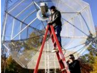
W3HZU's 4.5 m dish with 23 cm feed

W3HZU: Tim (W3TWB) barefoot.tim@gmail.com writes that the W3HZU Keystone VHF Club (FM10pa) has put up a 4.5 m dish and expects to be QRV on 1296 EME very soon. They have a 100 W SSPA, and plan to bring a 600 watt amp on line after initial testing. The club Facebook page is https://www.facebook.com/groups/311697959703/ .