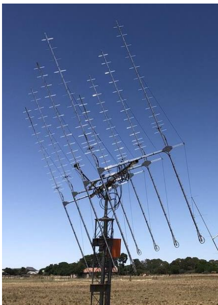
ZS4TX's 70 cm 4 x 2 yagi array with rotatable pole