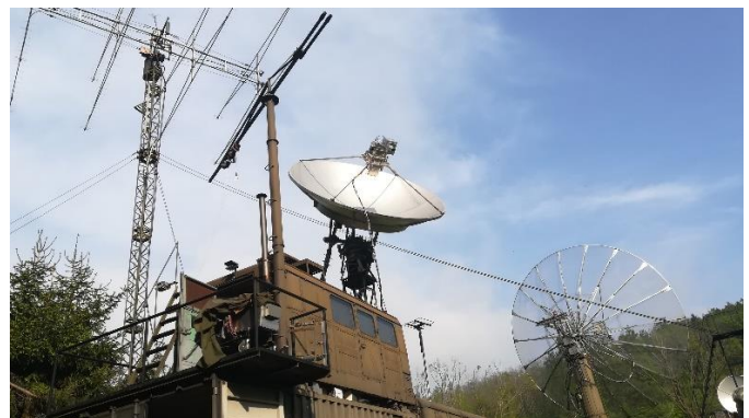
SP6JLW 3 cm dish is shown in the center

SP6JLW: Andy and Jacek sp6jlw@wp.pl were QRV in 3 cm CW Contest -- After a period of limited activity, we are back in the game with a successful start in the EU 10 GHz EME Contest. Our equipment worked flawlessly; the WX was also good. Contacted were PA3DZL, OK1KIR, OH2DG, HB9BBD, OZ1LPR, HB9BHU, IW2FZR, 9A5AA, F5JWF, OH1LRY, JA1WQF, DL4DTU, G4NNS, OK1DFC, DB6NT, F5IGK, SM6PGP, OK2ULQ?, F2CT, DL0EF, VE4MA, HB9Q, OK2AQ, WA9FWD, WA6PY, K6MG, JA4BLC, DG5CST, PA0BAT, SM4DHN, IK2RTI, DJ3FI and SM7FWZ for a score of 33x28.