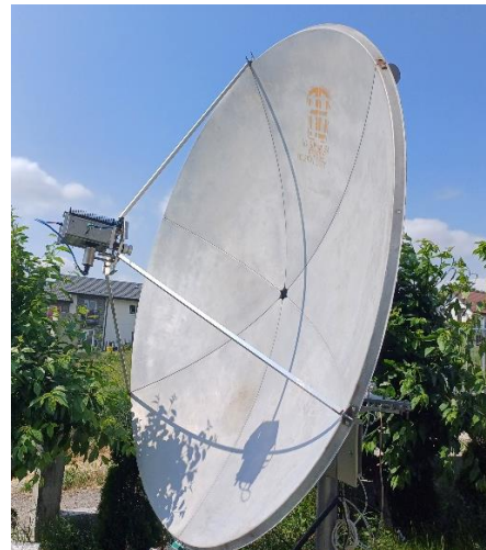
YO8RHI's 3m dish on 3 cm

TECH INFO: DJ3JJ posted important information about using the MRF13750h in SSPAs on 23 cm at https://www.grz.com/db/dj3jj . OE2IGL has developed a new EME Budget and Analysis Tool. The VK3UM EME tool is only correct up to 10 GHz. This new tool gives the most reliable results based on currently known dependencies. At higher frequencies and/or smaller beam widths additional dependencies must be taken into account such as atmospheric loss, Ruze loss, beam pointing loss