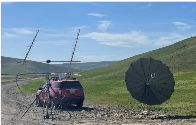
KA6U roving on the prairie on 70 and 23 cm

N1AV: Jay whereisjay@gmail.com is working on the microwave bands – I am collecting gear for 2.3, 3.4, 5 and 10 GHz EME. I hope to have stations up and running throughout the summer months. I have a 1.2 m dish for 6 and 3 cm and a 3 m dish for 13 and 9 cm. I am also working out the details for another dxpedition to KH6 in March 2024.