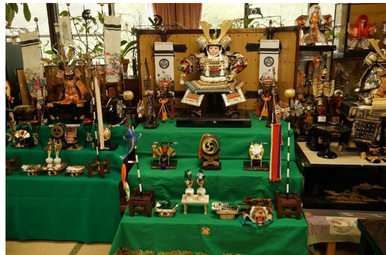
Season's decoration of May: Samurai's helmet, armor, and sword