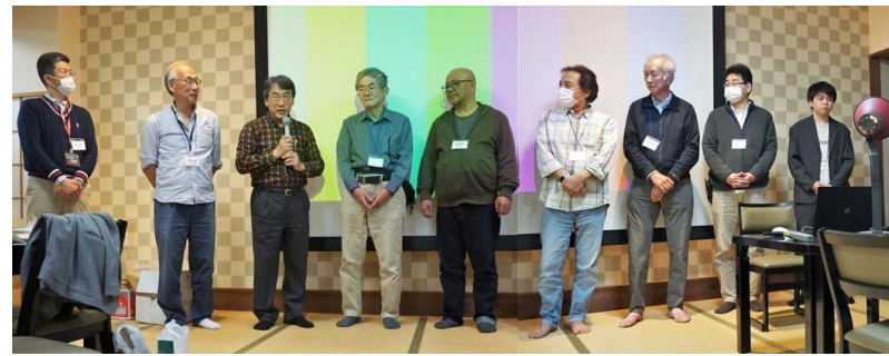
JA1- area attendees

and the difficulties they experienced on the isolated island – a very interesting story.