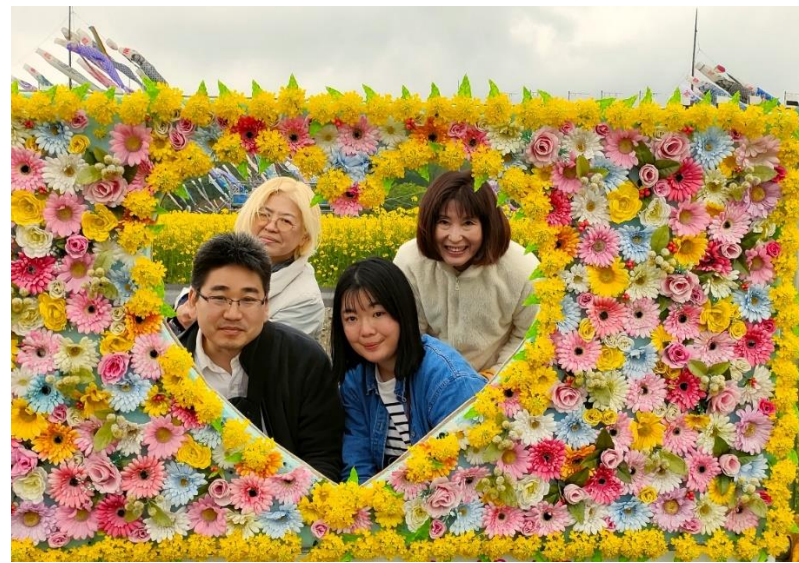
Spouse tour: Visiting a local flower park