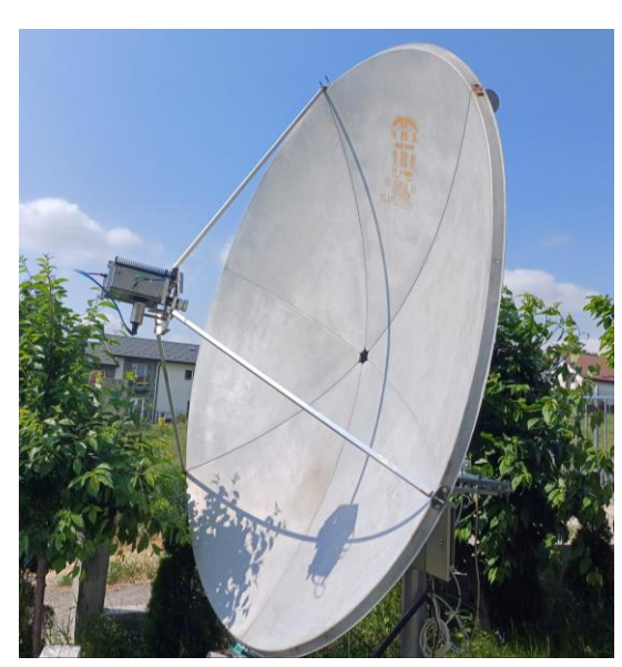
YO8RHI was QRV in ARRL MW Contest on 3 cm offering a new DXCC to many

dish. Unfortunately, I have missed the good Moon windows this month and I am heading to AZ for the winter starting 1 Nov, so my activity will have to wait until April 2024 when it will be my priority. The WX has turned cool (+10 deg C) and rainy, which is not great for 13 kV power connections! For the Oct ARRL 50-1296 EME WE, I intend to operate on 432. VE4SA will operate on 23 cm.