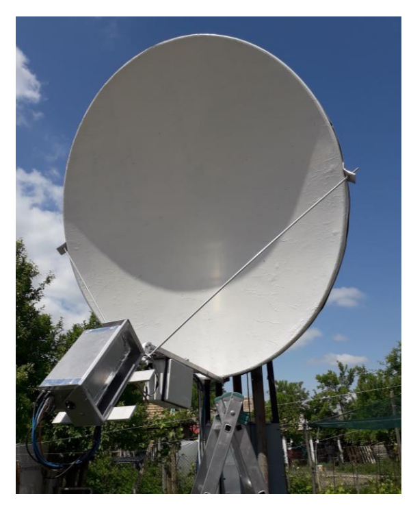
LZ2OC new 3 cm potential DXCC

total of 10 QSOS. I heard LU8ENU (20DB) but while in QSO, my PA quit. It was the power supply. I use two 24 V units to produce 51 V. The voltage was down to 25 V, and I was done for the weekend. If it is NOT raining for the Oct ARRL event, I will try my Teflon-taped feed and fixed power supply again. My biggest pleasures were working OH3 and UR3. Matti reminded me of my very first EME QSO on 1 Dec 2012 with another 70 cm OH: OH2PO. The UR3 QSO was special because after almost 11 years, it was my 100th 70 cm EME initial! EME is like a gambling addiction. No matter how much frustration, it just takes a little payoff to be hooked again!