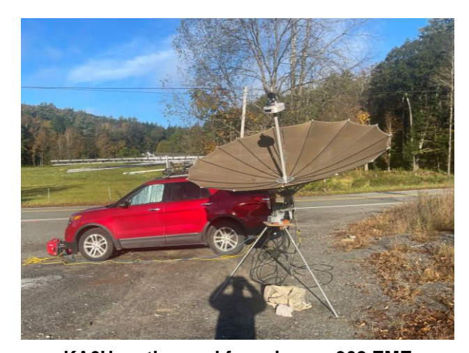
KA6U on the road focusing on 902 EME