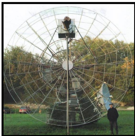
HB9SV with his dishes – RIP dear friend

The final Contest weekend is 25 and 26 Nov. I am anticipating a lot of activity as the Moon times are