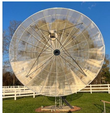
NC1I's new 6.1 m dish for 1296