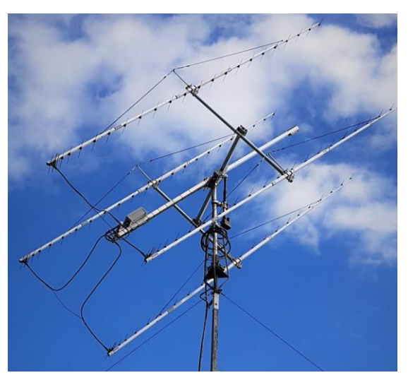
PA5Y 432 4 x PA432-23-6B yagi array used to win ARRL Contest single Op all modes all bands

DXPEDITION NEWS: There is not much dxpedition news this month. SZ5RDS was to be QRV on 432 EME from Rhodes on 70 cm by the X-Team of DH7FB and DF2ZC. They were to be on the island from 4 to 20 April with 2 x 17 el hpol yagis and 200 W on 432. However, illness has postponed the trip, see updates https://xteamdxps.blogspot.com/. KA6U is starting another round of State/grid EME dxpedition activity on 902 and 432 with some 1296 starting in TX on 22 April and to be on the road until about 6 May. See Peter's report in this newsletter (NL). N1V and W2HRO's dxpedition to KH6 (5 \sim 10 March was a huge success with record breaking QSOs on 902, 1296, 2304 and 10 GHz. See their report later in this NL. Also discovered that VK0DS is QRV on 1296 with a 2.4 m dish and 70 W linear pol from Antarctica (MC81xk) for a year. This is basically a one-person operation by Dave (VK2DJS).